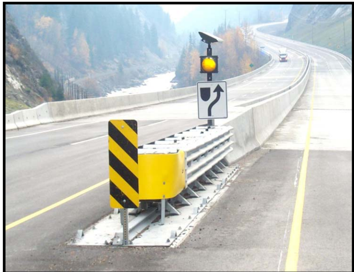
R247 24 Hour Flasher installed on Canada's Transcanada Highway as part of the Yoho Bridge Project.