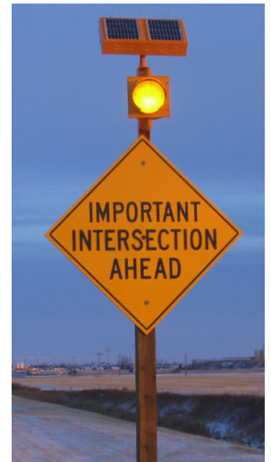
INTERSECTION AHEAD - MORINVILLE, AB